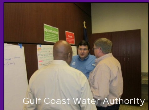
Gulf Coast Water Authority