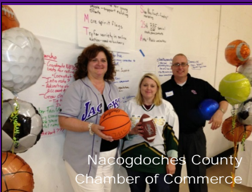
Nacogdoches County Chamber of Commerce

We help you develop an agenda, with achievable desired outcomes, to make the best use of your volunteers' time.