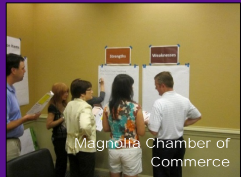
Magnolia Chamber of Commerce

Our strategic planning retreats involve all participants in the planning process. There are no boring sessions as they are always "hands-on."