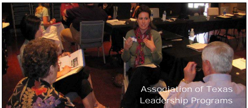
Association of Texas Leadership Programs