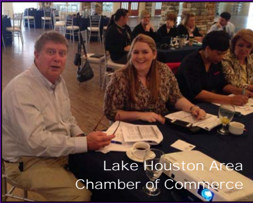
Lake Houston Area Chamber of Commerce